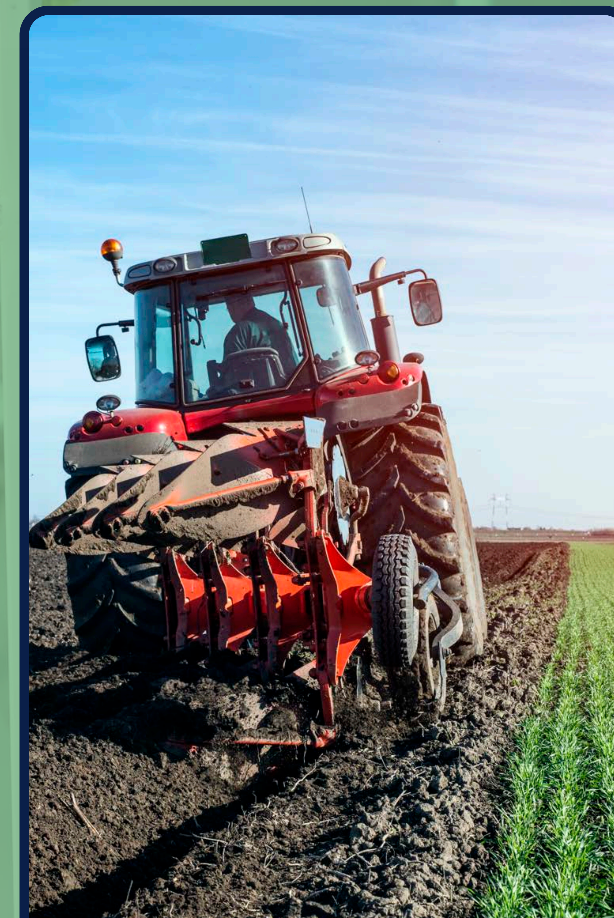
some plants are grown for humans and animals to eat; this farmer is harvesting crops