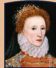
Elizabeth I (r. 1558-1603)