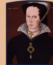
Mary I (r. 1553-1558)

made Wales Protestant after The Reformation