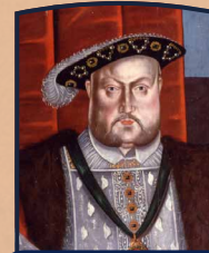
Henry VIII (r. 1509-1547)

made Wales Protestant after The Reformation