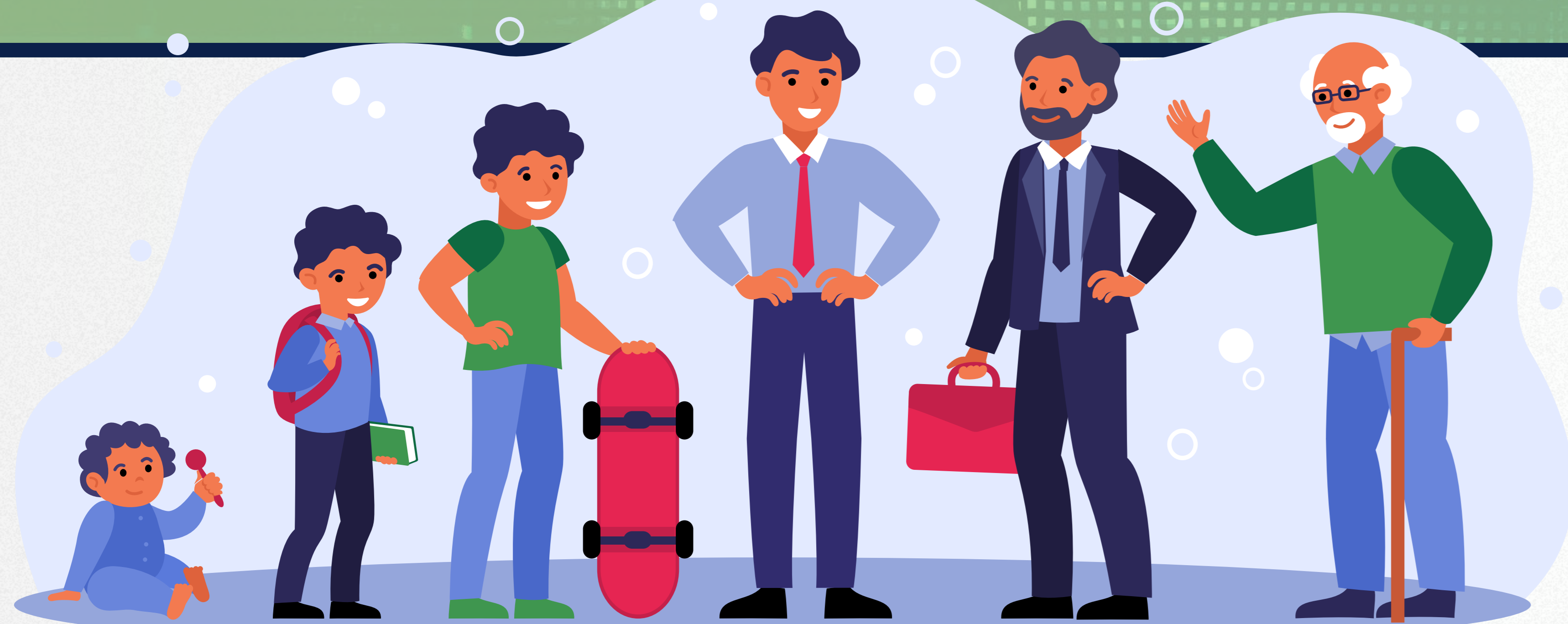
human growth stages