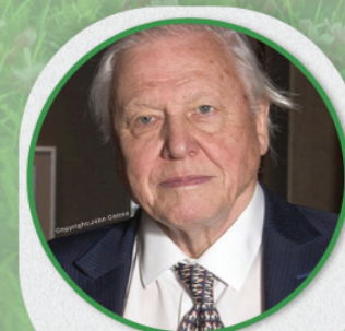
Sir David Attenborough