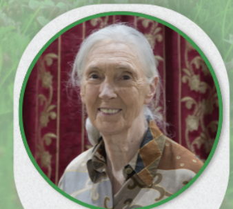
Dame Jane Goodall

a primatologist and world expert on chimpanzees